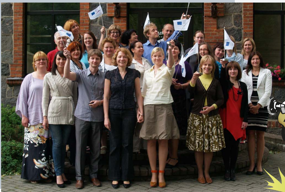
Project kick off meeting in Sigulda on the 26th and 27th of June 2012