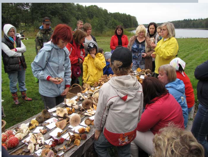
Fungi day in Ķemeri national park

In autumn 2012 two Biodiversity day events were organized – Mushroom days in the Rāzna region and the Pierīga region. In both places participants could learn more about different species of fungi and to take part in different activities all day long.