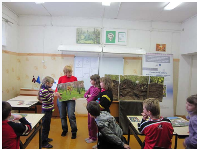
Study day in Sausneja Primary school.

Creation of a mobile exhibition (study days` boxes) is in progress. General conception about the contents of the boxes has been elaborated. The first two boxes about Owls and Ants have been completed – illustrations for story about owls, pedagogical conception, time plan, and worksheets have been developed and printed. These boxes consist of nature materials, worksheets, equipment for interactive tasks for children and illustrative material about life of owls and ants that is connected to the stories for children – „Owl’s Menarda hunting story” and „Lifestory of Red wood ant Rude” .