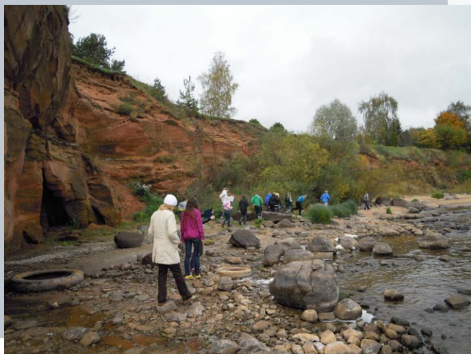
Study day near Lake Peipsi.

In October 2012 in total four for schoolchildren were carried out near Lake Peipsi. New quizzes and games were used during the programme called Lake Peipsi Travel Journal. All together there were 105 participants: 95 students and 10 adults. As written in the feedback form: „Children experience and learn much new and interesting during the study day, including academic knowledge and social skills” and „It’s very important for pupils to see and feel different landscapes and outcrops by themselves”.