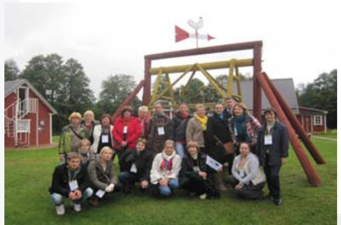
Participants of study trip in Estonia.

TEEC has also organized a 5-day study trip with 21 participants from 25th to 29th September, 2012 . Partners visited environmental information centres, nature parks, nature museums, regular schools, educative industry, expositions of Estonia, etc. Participants got knowledge about innovations in Estonian nature education and new inspirations for further actions. Joint discussions were carried out to collect new experiences and exchange ideas. There were also two hikes in nature, so participants could get new knowledge about nature trails' infrastructure. The main aim of the study visit was to create new cooperation possibilities for future actions, as well as to improve present partners networking.