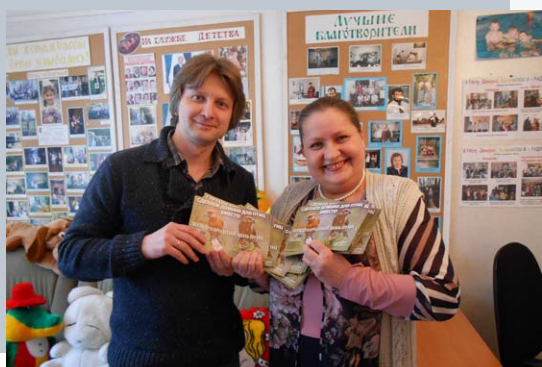
Biodiversity day for biology teachers of Pskov.

On 27th March, 2013 a Biodiversity Day (Bird’s Day) was organised – participation in the Methodological marathon with school teachers. During the event a presentation of the web-site “Birds of the Pskov region” and the field guide “Birds of the Pskov region” for biology teachers of Pskov was organised.