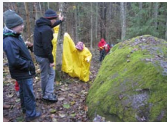
Study days in Vooremaa landscape protection area.

Study days of TEEC took place on 1st November, 2012 with 25 participants from Tartu Waldorfgümnaasium (secondary school) and on 2nd November, 2012 with 25 participants from Tartu Kivilinna Gümnaasium (secondary school). The aim of the study days were to make acquaintance with the Vooremaa landscape protection area in reality and to get new knowledge about ice influence on landscape in the Ice Age Centre.