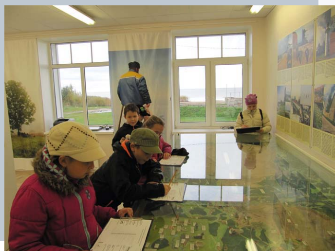
Study day on October 2012.

In March 2013 a 2-days first-aid course for 15 participants – NEC specialists and nature guides – was carried out. For those working with children and adults it’s crucial to know how to handle critical situations when first aid is necessary. As a result of the training, everyone feels much more confident to face potential threats.