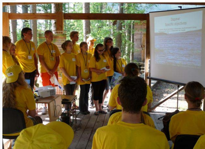
Final conference in the International Children Ecological Camp.

In order to develop international cooperation among school age children of Estonia, Latvia and Russia in the sphere of ecological education, studying the environment with purpose of biodiversity conservation and increasing ecological sustainability of protected areas, as well as to form and develop school children skills of carrying out surveillance and field studies, developing informative and presentation materials about the protected areas of the countries participating in the Project, from 23rd to 29th July, 2012 in the territory of the Sebez National Park in the Pskov Oblast the International Children Ecological Camp “Sebezshskoye Poozerye” was organised. Its 30 participants were schoolchildren from Estonia, Latvia and Russia.