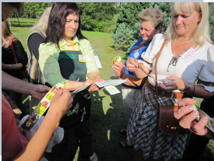
Participants of seminar about interactive learning methods.

On 16-17th August, 2012 seminar for nature education specialists (mostly nature guides) was held on the theme "Interactive learning methods" in Jaunkalsnava. Different lecturers, experts and nature education specialists gave presentations and practical workshops to show the best interactive learning methods in nature education. After the seminar participants admitted: „Seminar provided new ideas and inspiration to teach about nature more creatively and to try out new approaches in our daily work.”