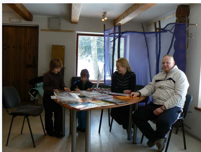
Nature education centre “Pauguri” in Līgatne nature trails.

Improvement of the Nature Education Centre „Pauguri” in Līgatne Nature Trails is one of the main activities of the partner within the Project. Qualitative furniture and office equipment have been bought for NEC's rooms, so preparing of nature education materials would be enabled. In order to supplement the NEC with methodical materials, books about different nature values and cyclopaedia were bought, too. The new NEC will welcome groups of pupils, students, families with children, as well as groups of adults to provide them possibility to learn about different themes of nature.