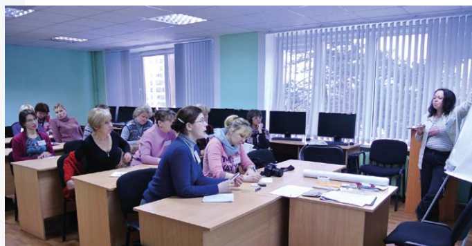
The beginning of the kick-off seminar for the «make a wildlife garden» short project for school teams.

The second training, also for teachers (on 10th February, 2013) was directed as a kick-off for the short project activity for 30 school teams on making a wildlife area "garden" in a school backyard. This mini-project for schools is being organised as a part of the "People with nature" Project, and its idea is to make a wildlife garden by a school which can be later used as a "nature tool" for teaching biology and environmental science. The main target group for the mini-project is school age children; its idea – to bring experience on working within a project activity on nature issues at school. Since the last year the Russian National Curriculum includes student's projects as element of teaching process in numerous school subjects. At the same time it is very hard to plan this activity even for teachers, thus the idea is to use scheduled trainings to support the introduction of new learning technologies in partner schools.