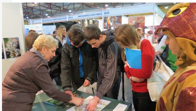
Nature education activities in fair “School 2013”