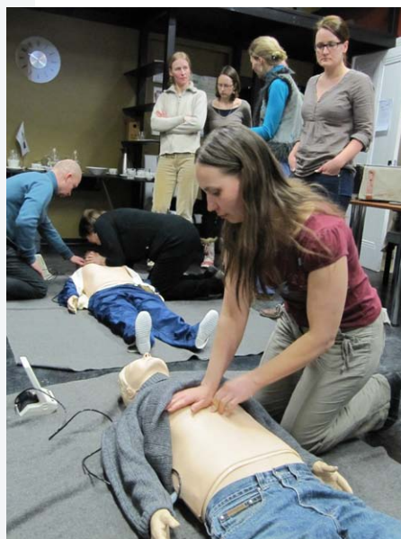
Participants of first-aid course.

In March 2013 a 2-days first-aid course for 15 participants – NEC specialists and nature guides – was carried out. For those working with children and adults it’s crucial to know how to handle critical situations when first aid is necessary. As a result of the training, everyone feels much more confident to face potential threats.