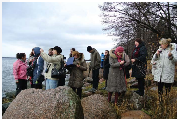
A crowd of teachers on a coastline of the Gulf of Finland near Primorsk town.