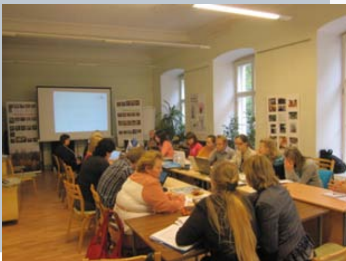
Project working group meeting in Tartu.

TEEC has organized, hosted and participated in the working group meeting in Estonia, Tartu on 24th and 25th September, 2012 with all together 22 participants – representatives of Project partners.