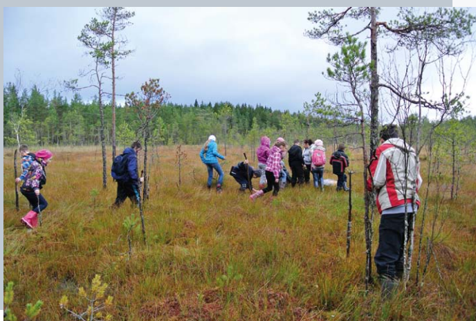
Spotting the peat bog wildlife.

Days of Biodiversity in the Zerkalniy Suburban Educational Centre (Leningrad region). Event was organized for students and was aimed on getting to know regional wildlife and phenological events of autumn. In total 13 schoolteachers also attended this 10-days long activity, and for them it was a training in use of local nature as a resource for the education process at schools.